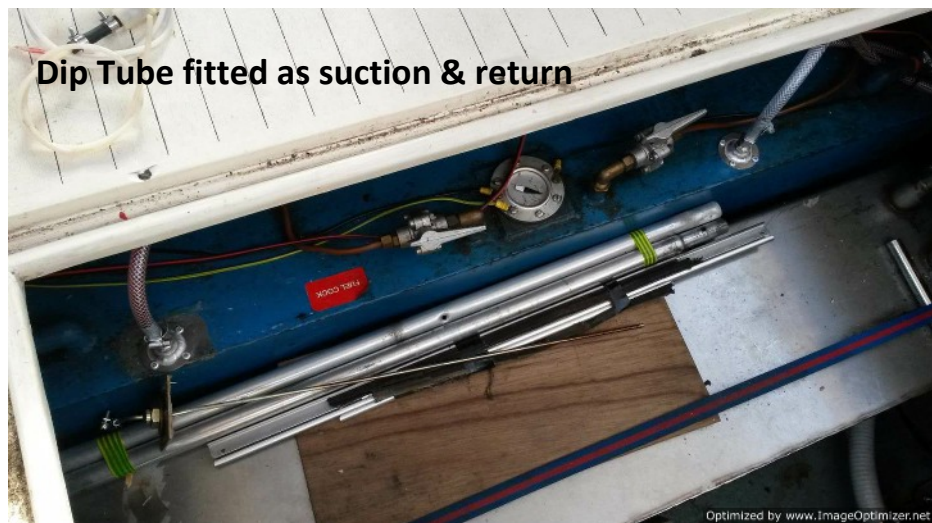
Dip Tube fitted as suction & return

Right: Two Dip tubes fitted one sucking from the bottom, the other returning to the top of the tank