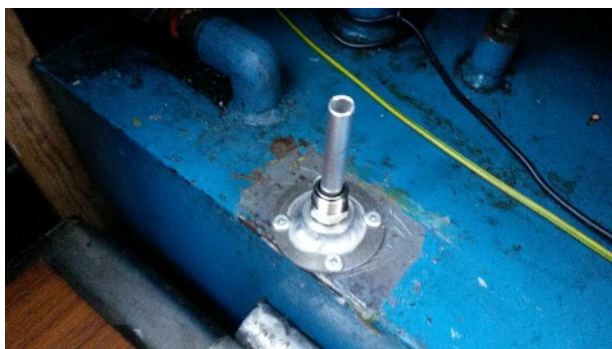
Above: Dip tube fitted to top of tank:

Right: Two Dip tubes fitted one sucking from the bottom, the other returning to the top of the tank