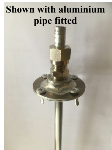
Shown with aluminium pipe fitted

RIGHT: The Dip Tube is a plate with a compression fitting that fixes to the top of the tank allowing a pipe to pass through to the bottom of the tank. The Diesel Dipper then sucks from the top of this pipe.