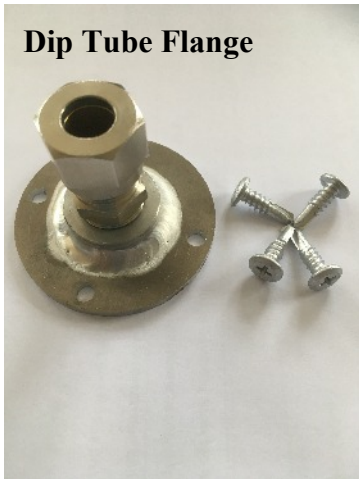
Dip Tube Flange

For tanks without a drain, we recommend fitting our Dip Tube Flange to the top of your tank.